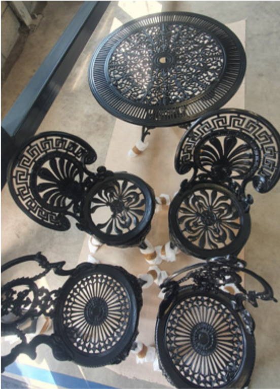
Metal garden furniture