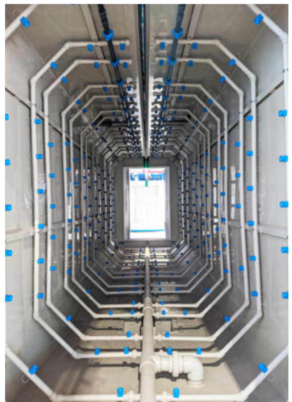
All three preparation cabins are equipped with a nozzle flush system