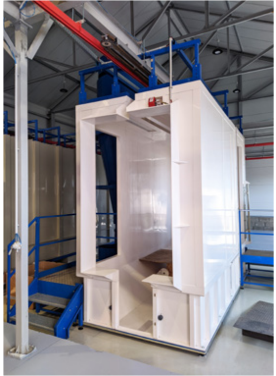
Powder coater chamber