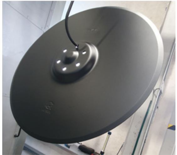
Agricultural machinery parts