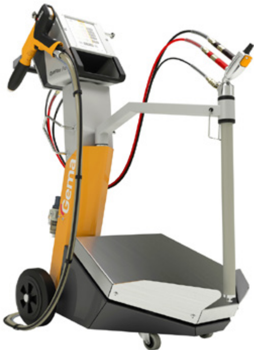
GEMA powder spray gun