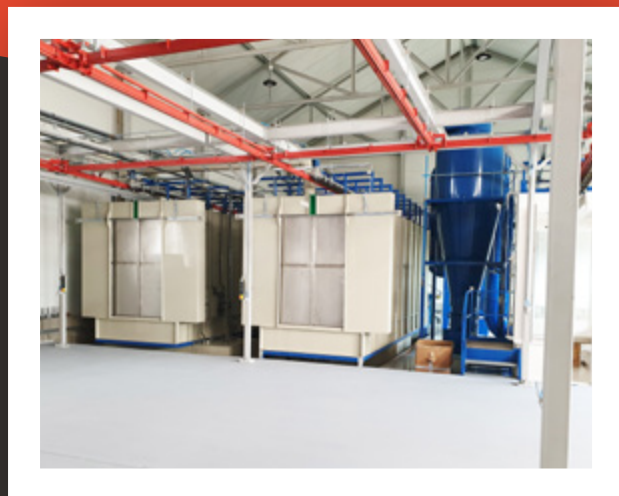
RO (dionic) rinse and passivation booth